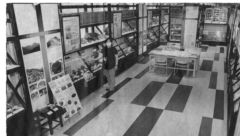
Mt. Besshi, World of Various Stones “Ores and rocks over 250 specimens”

Here in Niihama is the place where you can enjoy variety of some 250 stone specimens came from the Besshi copper mine which had brought prosperity to Niihama. The name of the place is “Furusato Labo”, the home town reference room in “Bunsen”, the Civic Culture Center ( Shigemoto-cho, Niihama-city). Let us immerse ourselves in the world of stones which reflect the tremendous natural history of the earth.