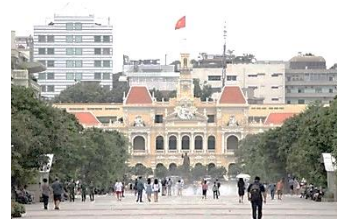
Square in front of Ho Chi Min City Hall