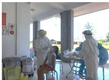
My daughter got PCR test at quarantine facility

Eventually, at the beginning of June this year, the Embassy of Vietnam informed me that my husband (who just wanted to visit me for 2 weeks last year but was stuck in Japan because of COVID-19), my daughter, and I could return on a repatriation flight from Tokyo. There were only 3 days for preparation, so I could not say goodbye to all of my friends in Japan!