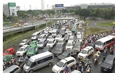
Traffic on the road to the airport in Ho Chi Minh City

Since the beginning of July, right when I finished my quarantine and came back home, the whole area has been in a hard lockdown. People cannot leave their homes at all, except for buying groceries in their town and for medical emergencies. All non-essential businesses and restaurants are shuttered, all public gatherings of over 2 people outside of offices, schools, and hospitals are not allowed, and the public transit system is temporarily suspended. Multiple checkpoints were established across my city to make sure residents comply with the strict social distancing requirements. Even so, I think if this situation continues, people who are currently not working or are working in the informal sector will have it worse, with many people not having enough food to survive.