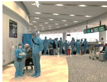
At boarding gate back to Vietnam from Narita Airport

We flew to Narita Airport on June 5th from Matsuyama, where we were required to wear masks, goggles, and protective suits inside the plane. I arrived in the middle of the night at an airport far away from my hometown. There were no other passengers besides us at the airport so all the customs procedures and medical checks were carried out quickly. Then, we were sent to a mandatory quarantine facility – a converted university dormitory – where we spent the next 21 days. I was very worried at first but that fear disappeared after just two or three days. Everything was provided: drinking water, 3 meals per day, and necessary personal items. We were PCR tested 3 times to make sure that we didn't contract the virus. Then we had to isolate ourselves at home and monitor our health for 7 days afterwards.